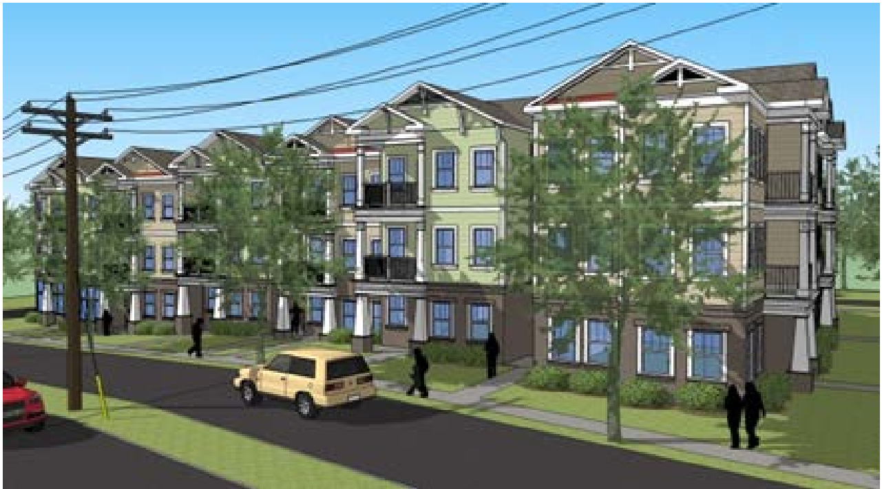
TRINITY WALK III PERSPECTIVE

Trinity Walk Phase III is planned for construction at 1111 Oakview Road, Decatur. DHA is competing for tax credit equity to develop this project of 34 units. DHA applied in May of 2017 and hopes to be awarded tax credits in November of 2017. If successful, DHA will begin development of the 7 two-bedroom and 27 one-bedroom units in 2018. These homes would be 34 new affordable housing units in Decatur. DHA is undertaking the demolition now.